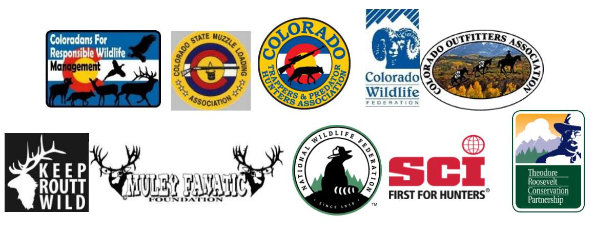
May 2, 2023